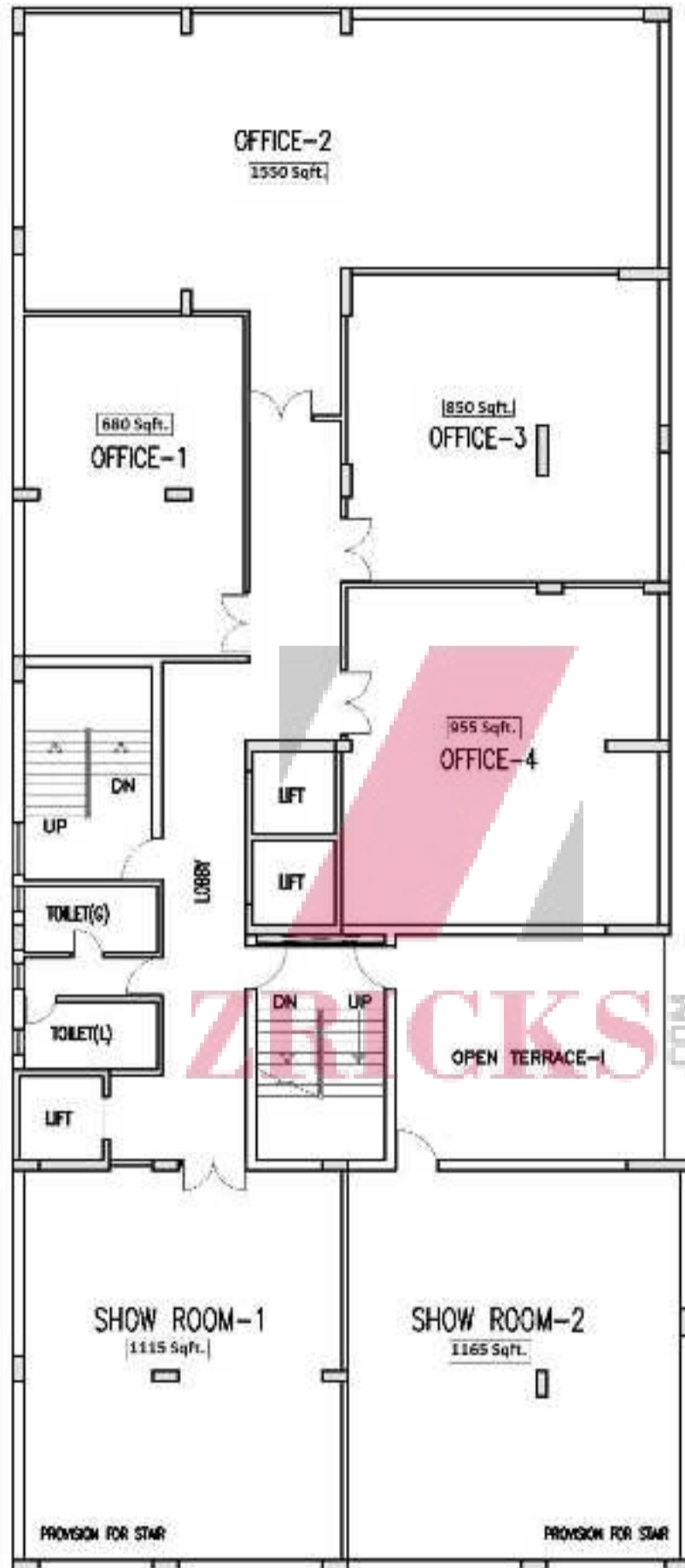
FIRST FLOOR PLAN (COMMERCIAL)